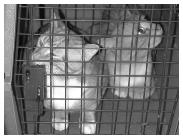
Hey, Butch...how you makin' out on that lock? You might want to pick up the pace...Someone's comin' to get us, and he looks like he means business!

And we remember the people. It was great to meet some of our clients and see firsthand how much SNAP's help is needed and appreciated.