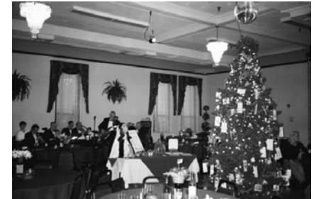
The Moonlighters & the Angel Tree

After the gala affair had ended, as SNAP volunteers converted the Vandivort Ballroom back to its original elegance, all agreed that our first annual wine tasting was a huge success. Next year's event promises to be even more spectacular. So, on behalf of many appreciative pets and their grateful owners, thank you, one and all, for your gifts, donations, contributions and above all your ongoing support. You've truly embodied the spirit of the holiday by joining SNAP in our resolve to lead the way to the day when there are no unwanted pets.