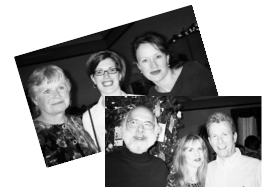
Partiers pose for our photographer

in-need-of-a-fix" list. Guests were encouraged to help penniless pets of their choosing by plucking the ornamented envelope bearing the name, sex, age and breed of a speuter wannabe and inserting a donation to fund that pet's spay or neuter. Partiers eagerly searched the tree to find that special Fox Terrier mix or exceptional calico cat they most wanted to help. By the end of the flurry of activities, 27 enveloped pleas for assistance had been answered by bighearted donors surrounding the yuletide tree.