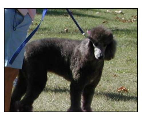
A full shave-down might have been the preferred hairdo of the day, but this poodle braved the heat anyway!

for eating it fast and often! How hot was it? Talk about hot dogs! It was so hot, several pooches were cooled by