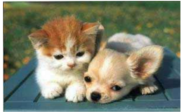
Kittens 'n cats awaiting sponsors:

For a complete list of animals awaiting sponsors, visit our website at www.snap123.org .